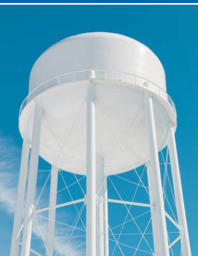
Side View of Water Retaining Structure