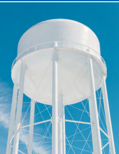
Side View of Water Retaining Structure